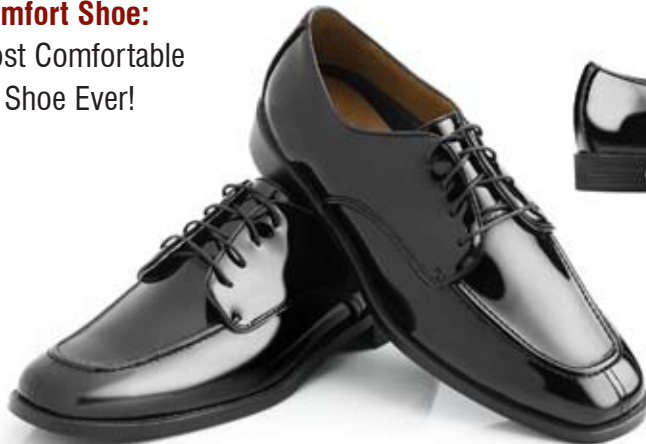
Black Comfort Shoe (BCS)